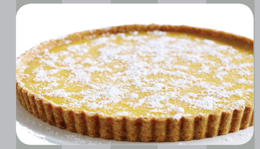
Tarts (Mango, Apple, Kiwi, Lemon)