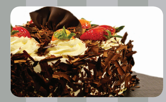
Black Forest Cake

A chocolate sponge cake filled with cream and cherries. AED 120 per kg