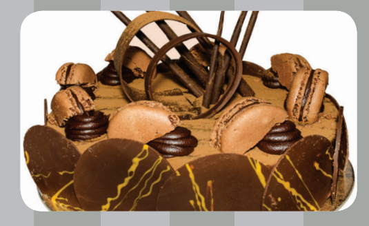
Chocolate Truffle Cake

This cake is rich in taste and texture dominating with chocolate flavor. AED 120 per kg