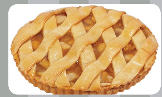
Pies (Apple, Lemon, Pumpkin, Blackberry)